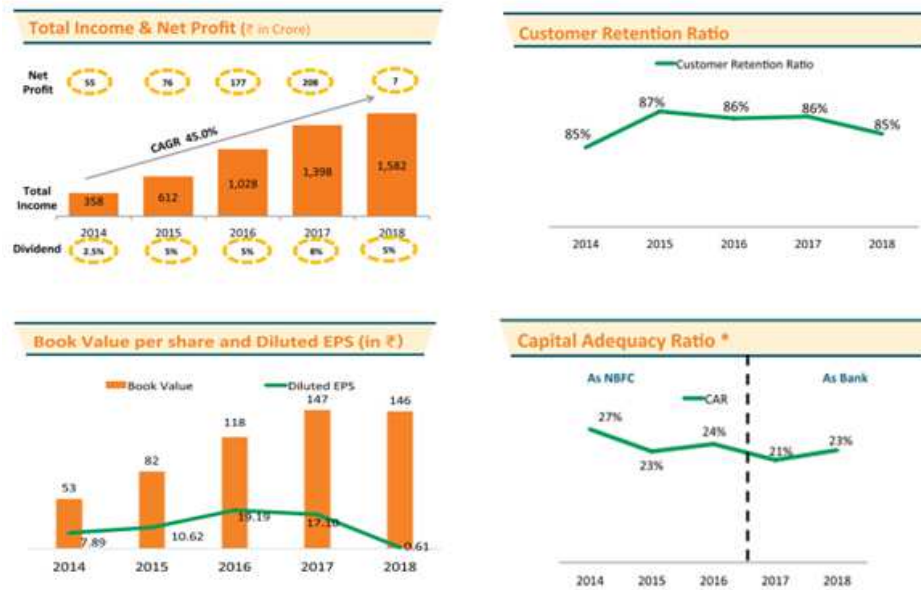
Figure 1: Total Income and Net Profit, Book Value per Share, Capital Adequacy Ratio, Customer Retention Ratio (Source: Annual Report 2017-2018)

Performance of Ujjivan bank in comparison of BSE Sensex, Nifty can be diagrammatically presented as: